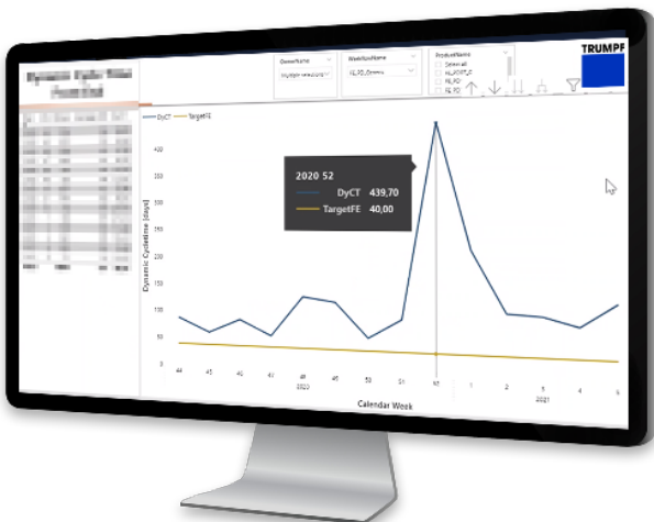
Example of reporting in MS Power BI based on the data model

In the introductory and design phases, we talked about using a data lake to realize the data model, but following new insights from the workshop, we decided to change the requirement to a data warehouse. The reason was that, from a technical perspective, we wouldn't need to collect real-time or unstructured data. Traditional layer modelling in the data warehouse provides a central and transparent single point of truth, which can be queried by the usual BI tools and therefore integrated into the TRUMPF system environment. The data warehouse is also scalable and can be used to meet many other requirements in the future.